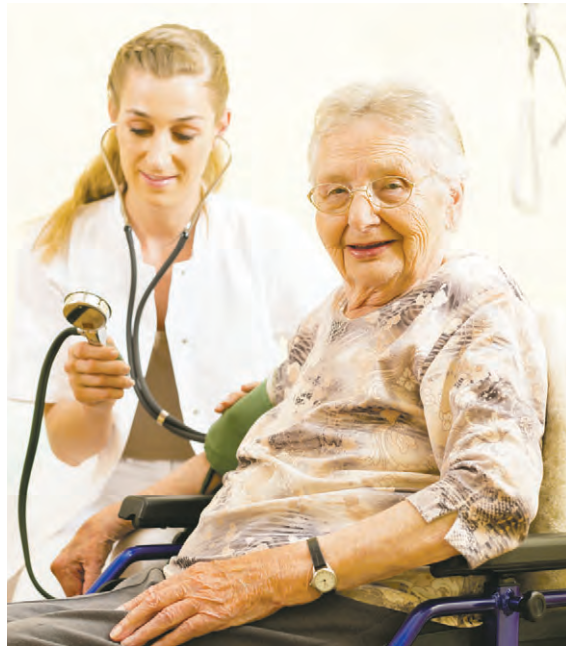
Before release, a nurse navigator works on a discharge plan. Within two days after release, a Philadelphia Corporation for Aging bridge care coordinator visits the home to help with follow-through.

To be eligible to participate in the pilot project in North Philadelphia, individuals must be Medicare fee-for-ser-