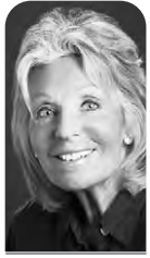
By Sally Friedman

After years of grabbing a few days at the beach with our kids when they were little bucket-toting beachcombers, the "new normal" began about 10 years ago. Now, our annual pilgrimage to Long Beach Island (LBI) plays out with the role reversal that we should expect by now, but that still comes as a slight shock.