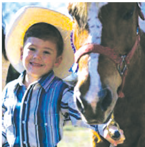
Pony rides were a special treat.

Not that Ogden Street families went downtown often. The 52nd and Market Street area provided ample shopping