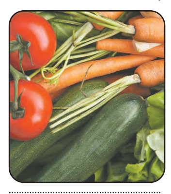
Art from the Heart: Helps children with grief... 8