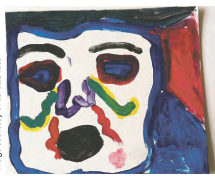
Artwork by an 8-year-old depicts sadness.