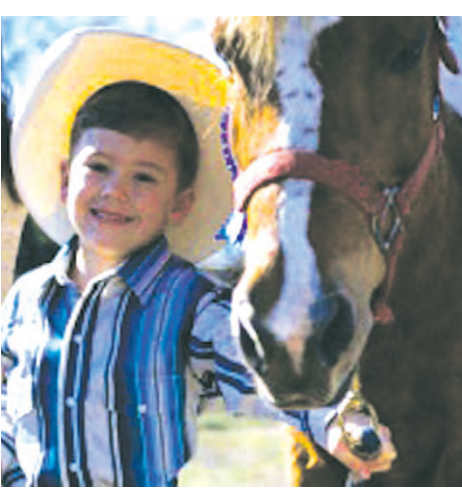
Pony rides were a special treat.

Not that Ogden Street families went downtown often. The 52nd and Market Street area provided ample shopping