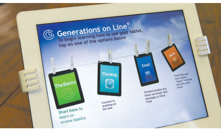
Generations on Line helps to promote internet access and skills for older adults through an easy-to-use software program tailored to this age group.

cognitive impairments that come with problems associated with Alzheimer's disease and other forms of dementia. Includes quizzes and games, big buttons, voice command controls and more.